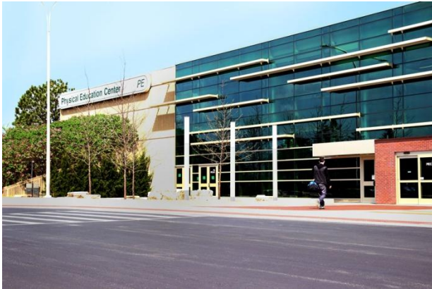
Aurora High Density Mobile Storage System for men's and women's athletic team storage.