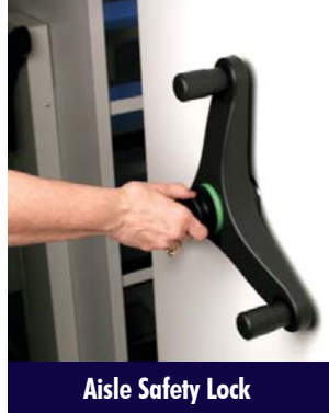
Aisle Safety Lock