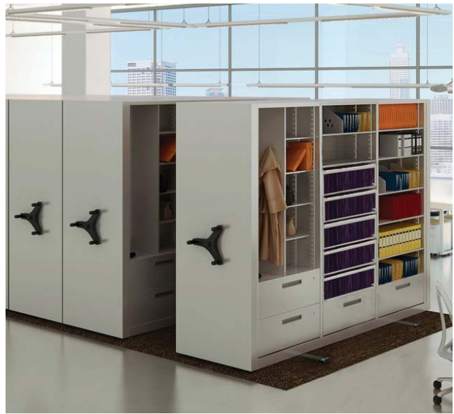
Shared Departmental Storage with Hanging Files