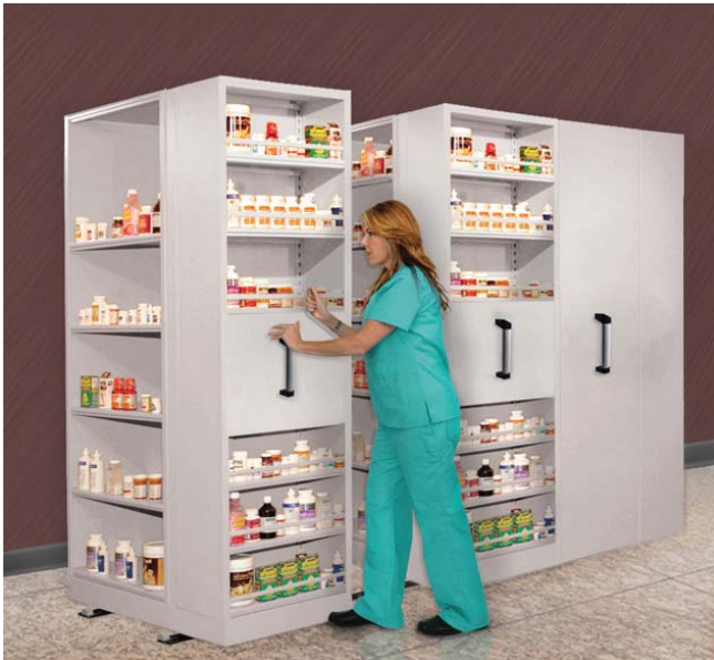
End-Stor™ for quick access applications such as pharmacies.