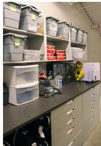
College of DuPage Athletic Department: Storage for golf bags and golf shirts. (Left) Mechanical Safety Sweep stops carriage movement. (Top right).