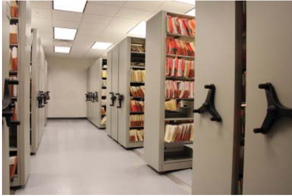
High Density Filing