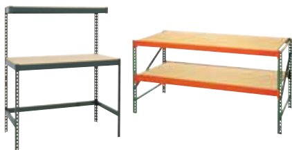
Workbenches & Packing Tables