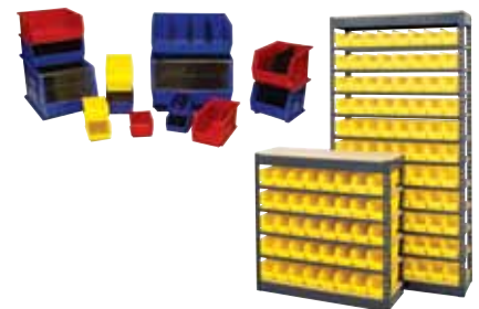
Bins & Boxes