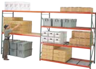
FastRak Bulk Shelving