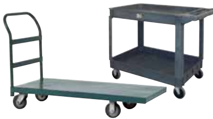
Carts & Trucks