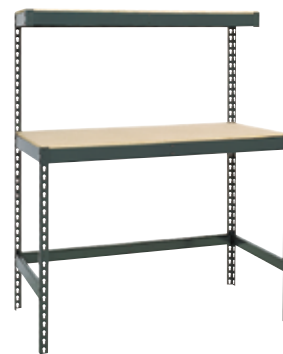
Worksurface plus top shelf