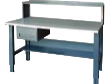
Worksurface w/Bottom Shelf, Riser & Drawer