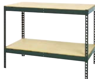
Worksurface plus bottom shelf