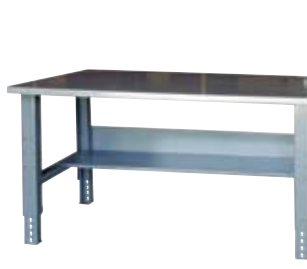
Worksurface with bottom shelf