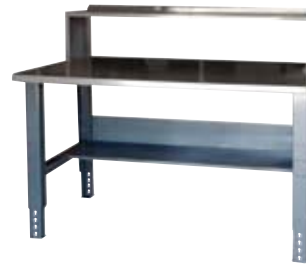
Worksurface w/Bottom Shelf & Riser