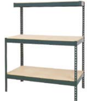
Worksurface plus top and bottom shelf