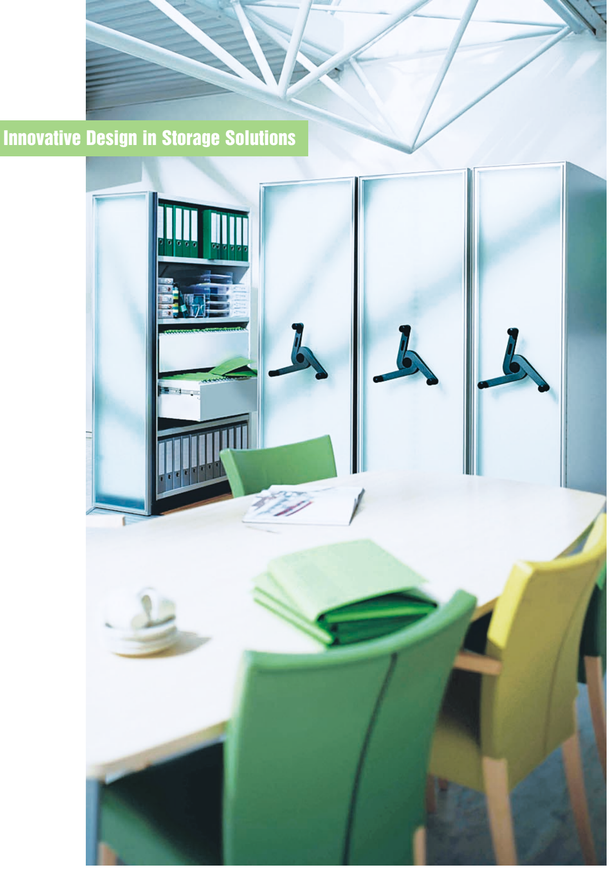
You design it, we create it.